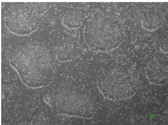
CiRA -jk-0049-E: passage-2