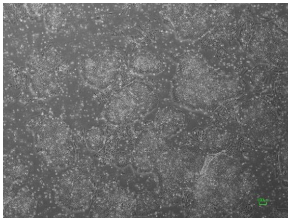
CiRA -jk-0049-B: passage-2