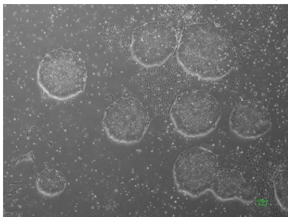
CiRA -jk-0049-D: passage-2